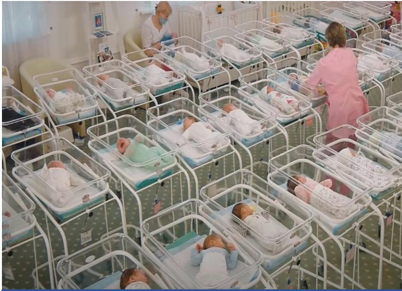
Screenshot from YouTube © Credit: Biotexcom clinic